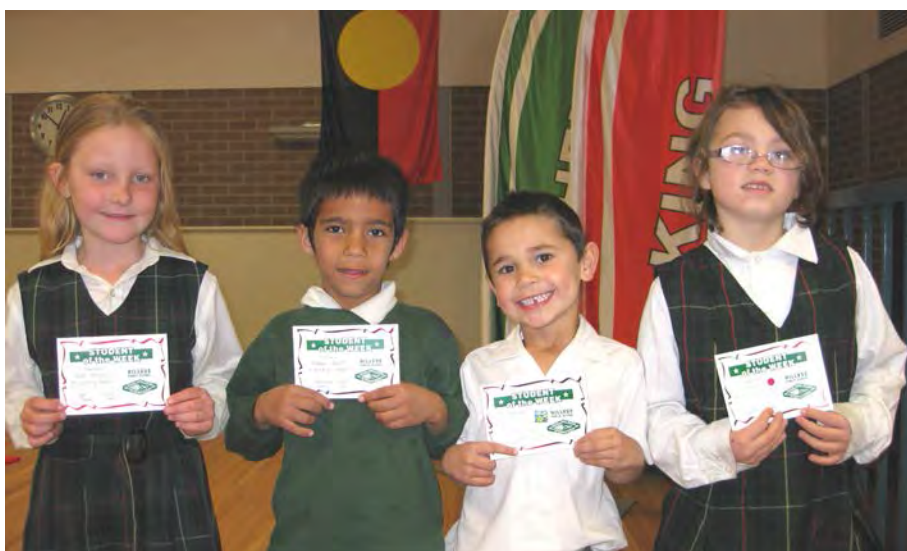
Student of the Week Awards