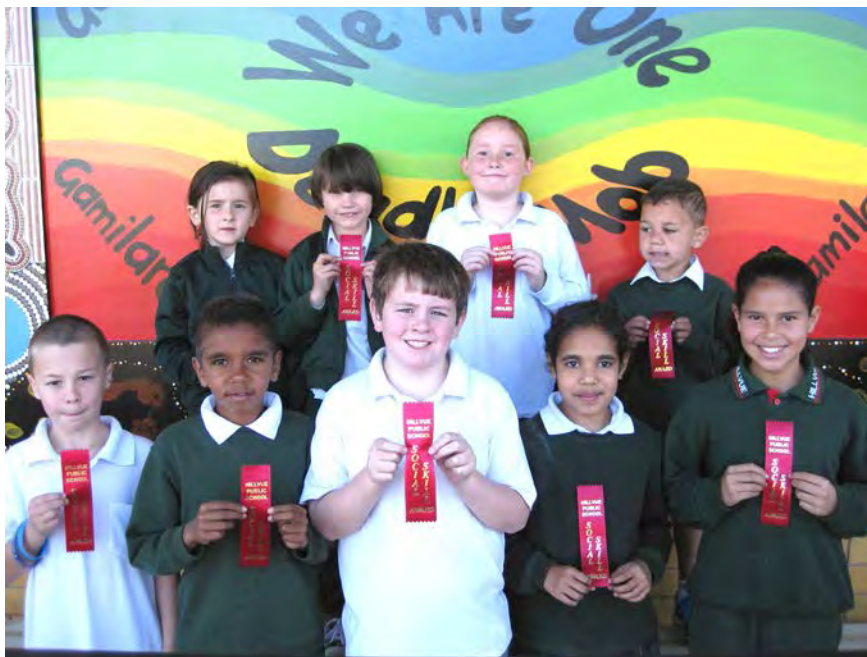
Social Skills Awards