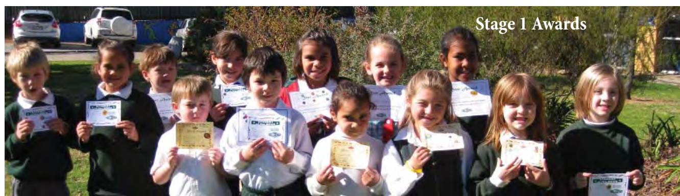
Stage 1 Awards