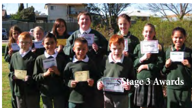
Stage 3 Awards

Awards pictured - Green Level Awards Pennant Level Awards Red and Gold Awards Playground and Classroom Rewards winners.