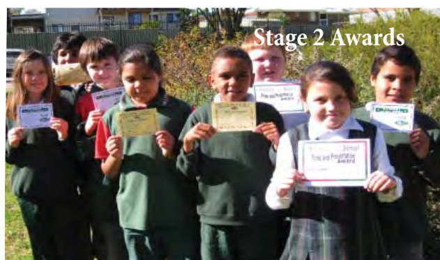
Stage 2 Awards