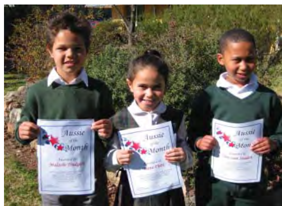
Aussie of the Month Nominations and Award Winners