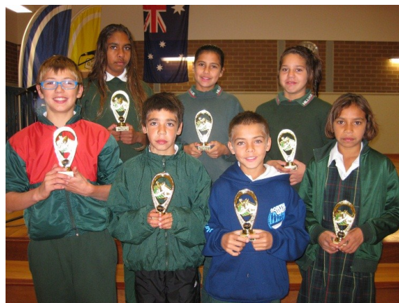
Congratulations to our Athletics Champions for 2013

Representing Hillvue PS at any sporting event is a privilege. This privilege may be withdrawn if your child's behaviour at school is unsatisfactory.