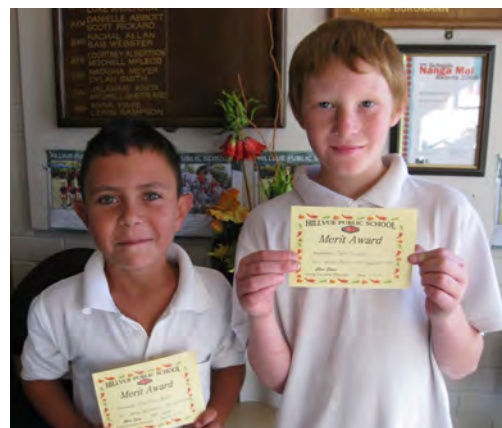
PRIDE & PRESENTATION