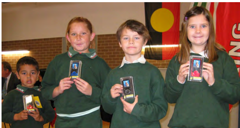
PLAYGROUND and CLASSROOM REWARDS RECIPIENTS