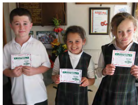
STUDENT OF THE WEEK