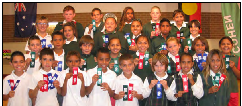
Well Done to all placegetters from our Athletics Carnival last week!