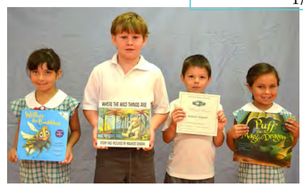
Class Awards 1/2D - 1H