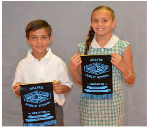
CULTURAL BLUES SPORTING AND ACADEMIC