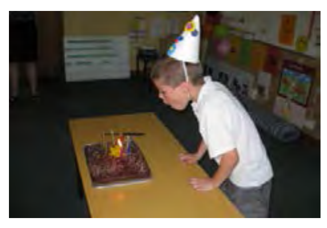
Class 1/2D have been studying CELEBRATIONS. As part of this Unit they held a Birthday Party.