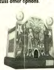
IT'S A GIRL THING Medium