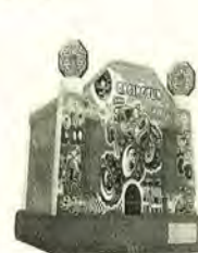
RACING FUN Medium

All you need is an area of 6m x 6m of level flat grass surface www.mysticjumpingcastles.com