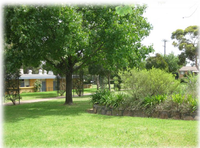
HILLVUE SCHOOL IS LOOKING A PICTURE AT PRESENT