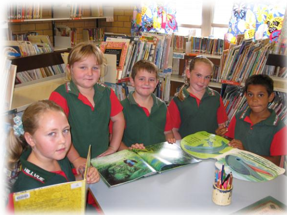
This happy group of students were pictured enjoying time in the Library