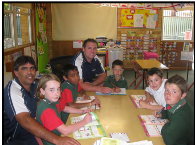
3-6J enjoying their maths activity

Need Somewhere safe for the kids to "Trick or Treat" this Halloween?